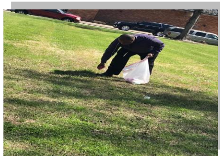
PAT Director is hiding eggs