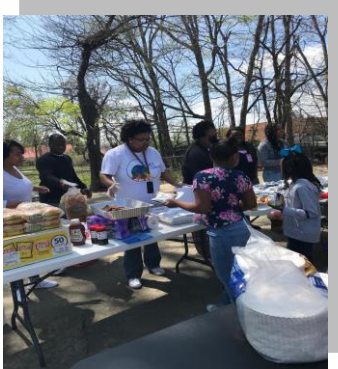
Staff is serving attendees