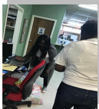
Staff is prepping for hunt